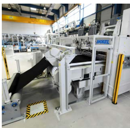
ANDRITZ SDV velour needleloom