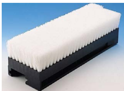
Patented ANDRITZ brush